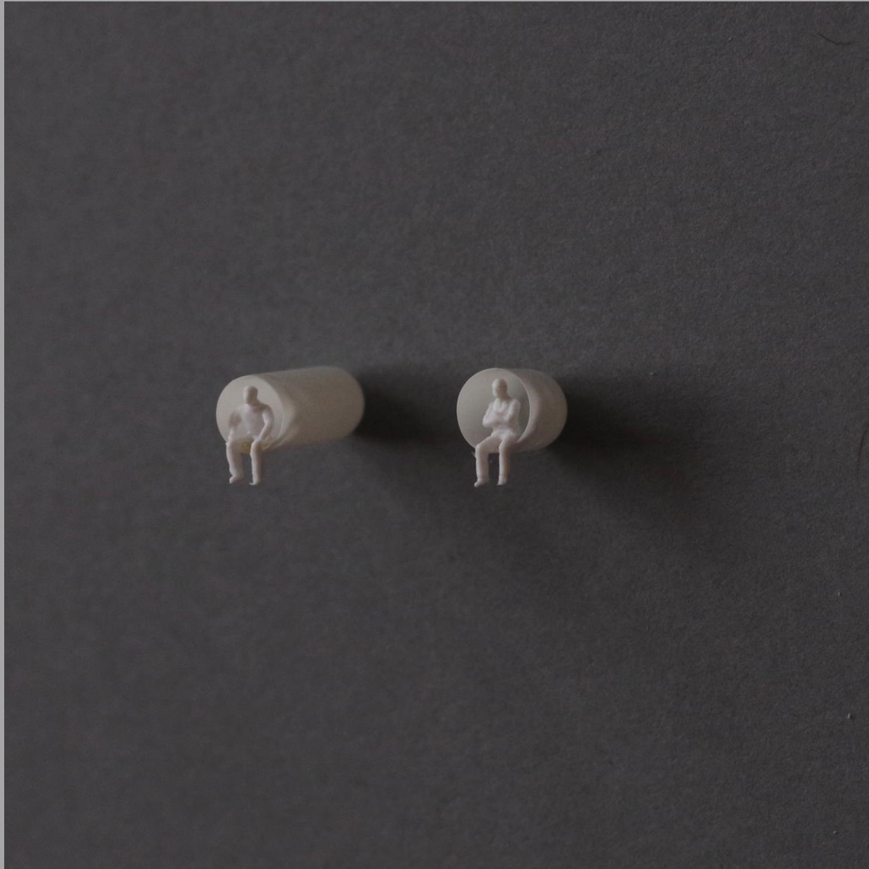
Thinkers , from the MediCALL IN cycle, own technique on cardboard, 13x13 cm