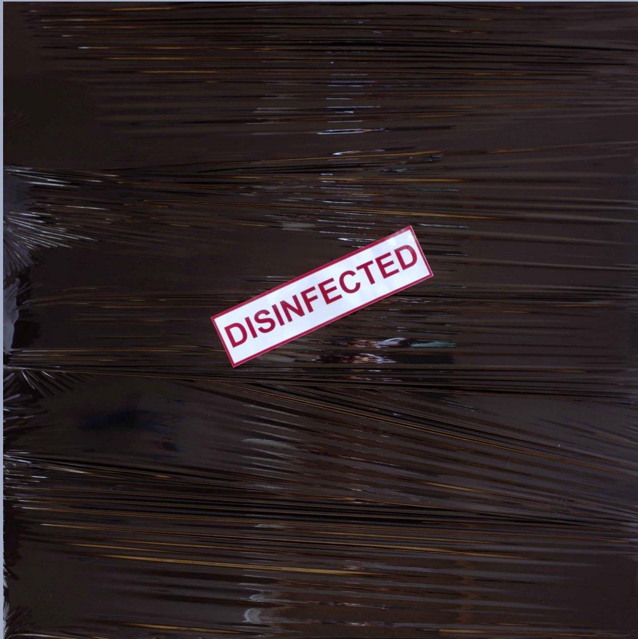
3, from Lost landscapes cycle, oil on canvas, black foil, 120x120cm