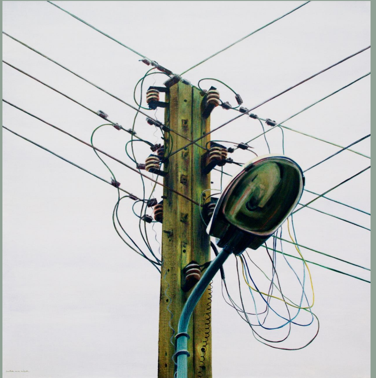
6, from The Observers cycle, oil on canvas, 100x100cm