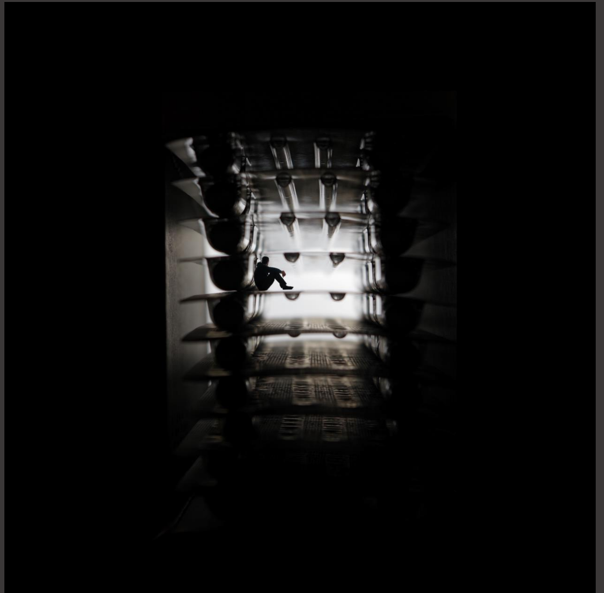
(S)Cared of, from T(he)rap(y) cycle, digital collage, 25x25cm