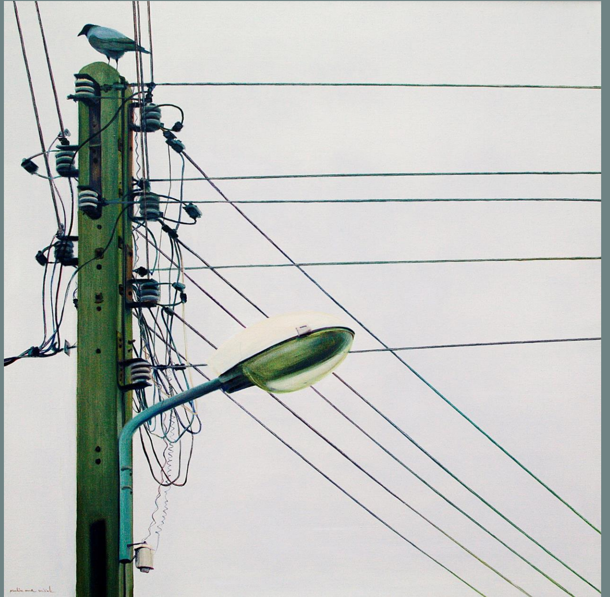
5, from The Observers cycle, oil on canvas, 100x100cm