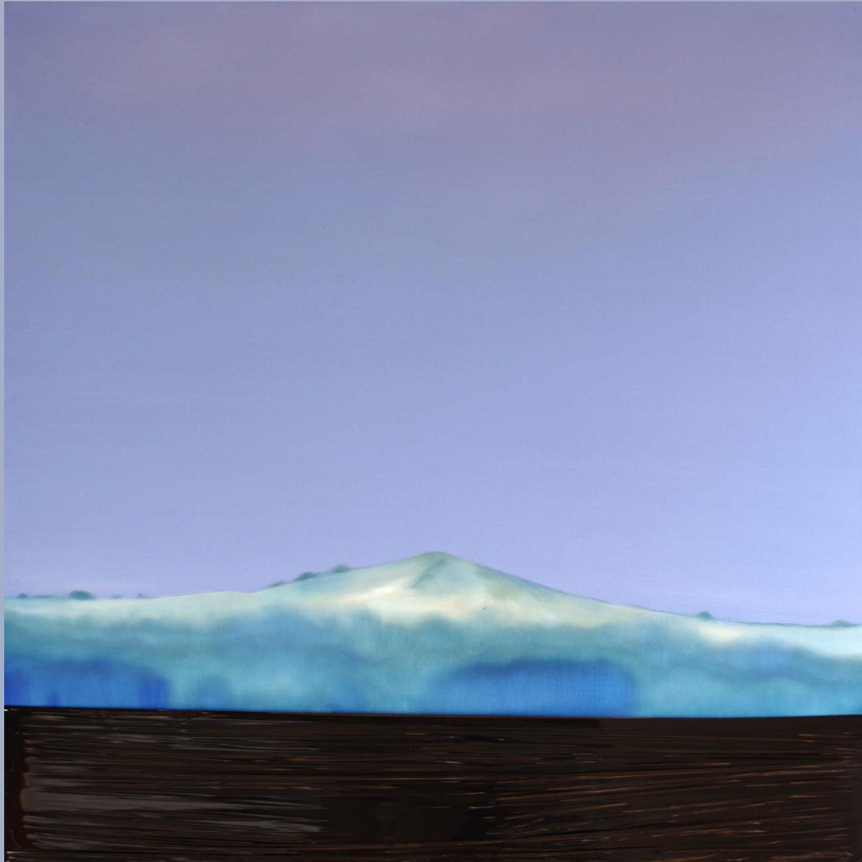
2, from Lost landscapes cycle, oil on canvas, 120x120cm