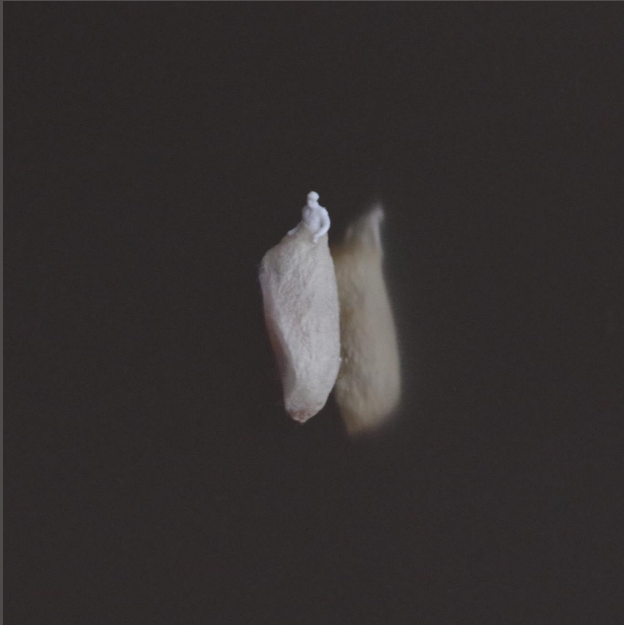
The Newborn , from the NaturALL IN cycle, own technique on metal, 13x13 cm